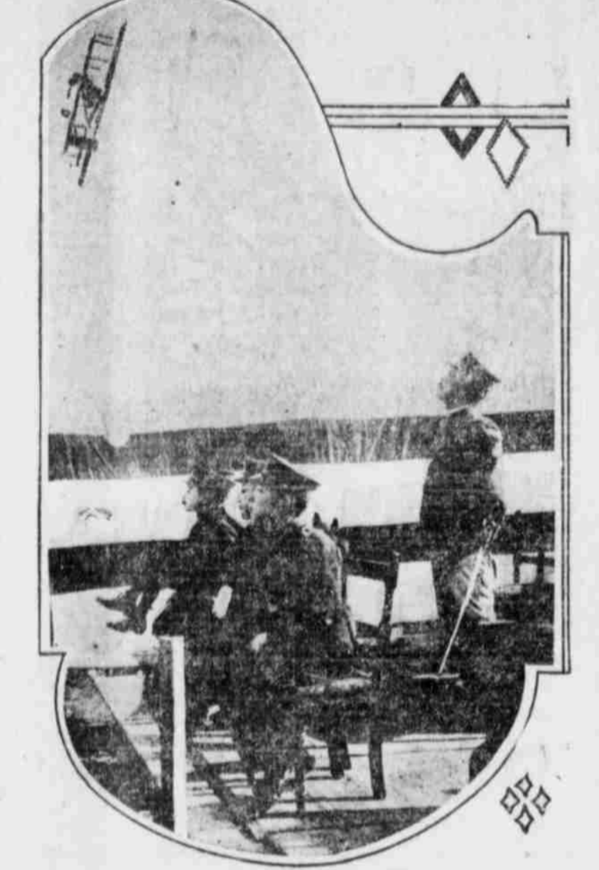
Their imperial highnesses, Princess Michi, Takamaku and Higashi Fushimi and their associates, who are sons of exalted Japanese families, viewing the flight of Art Smith, American aviator. The picture was taken at the Aoyama parade grounds a short time before Smith's recent accident in which his right leg was broken. Smith has dazzled the Japanese people with his daring.