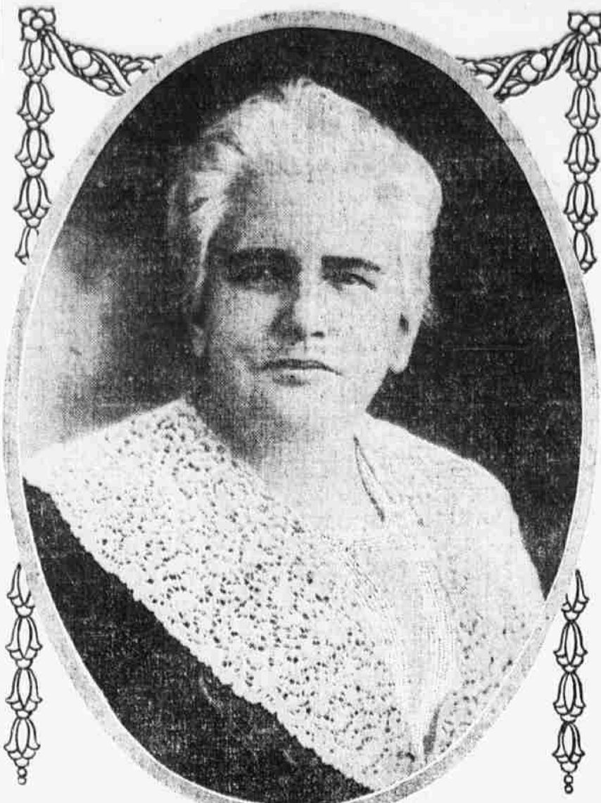
REV. DR. ANNA SHAW