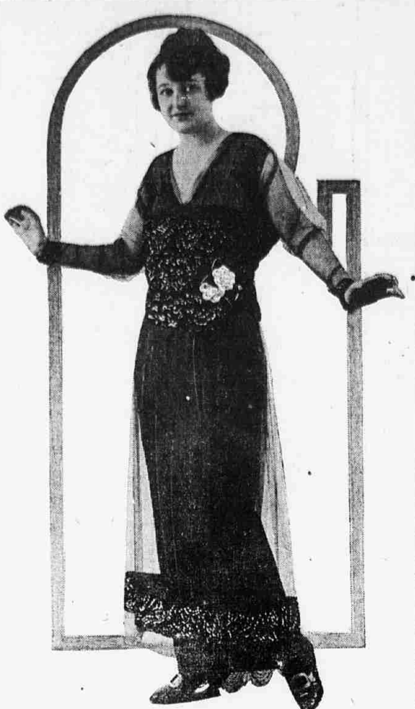
THE NEW BASQUE GIRDLES WITH LONG SLEEVES

But alas! The flower stem that had been so brave and strong when the