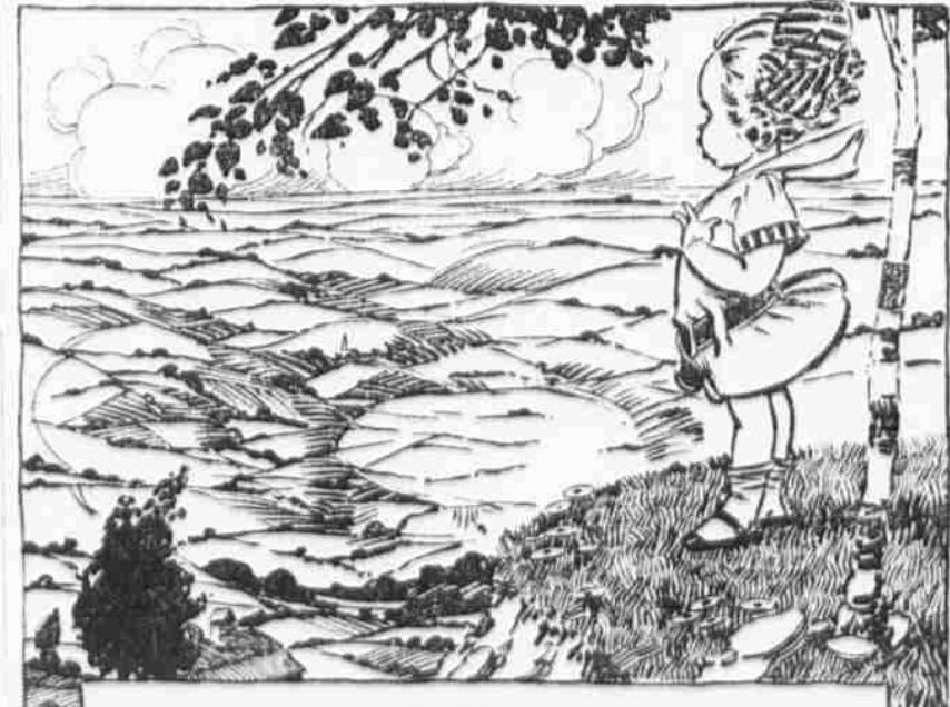
THE WORLD FROM THE HILL