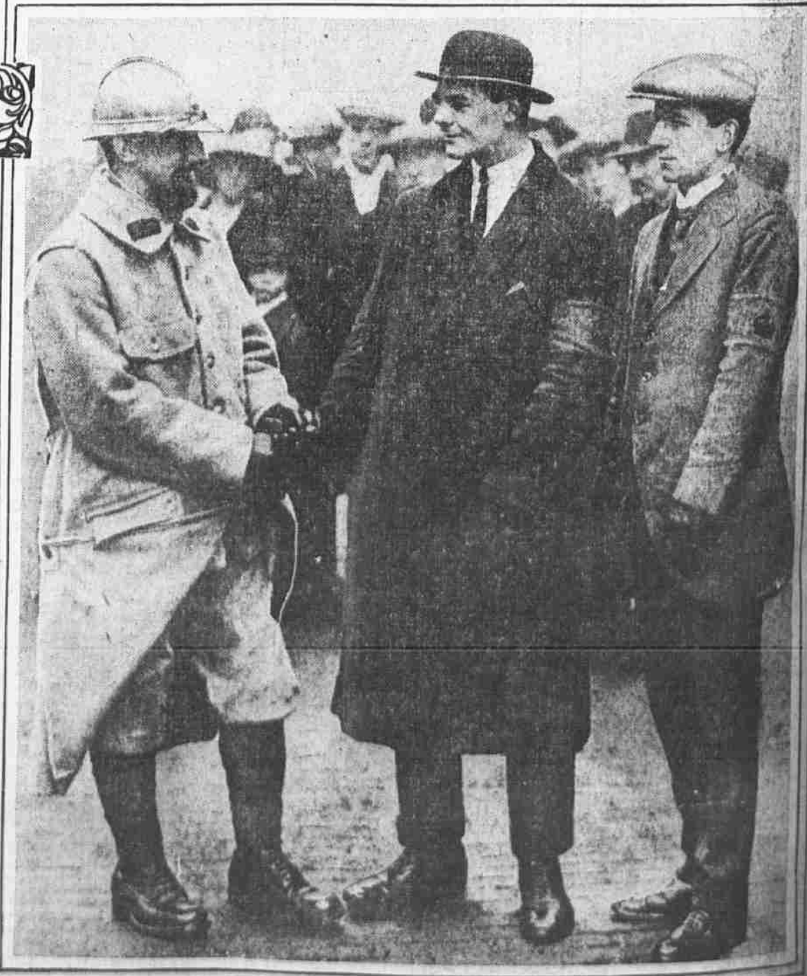
WELCOMING THE NEW RECRUIT IN ENGLAND As soon as a new recruit offers himself he is congratulated by a soldier lent by France, this being one of the many devices with which the British authorities hope to stimulate enlistments.