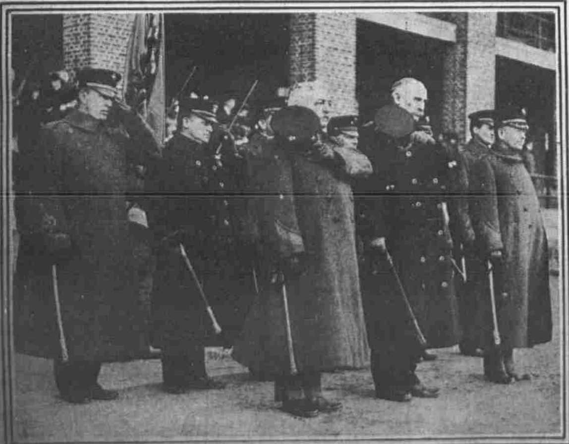
AT THE MARINE CORPS REVIEW AT LEAGUE ISLAND

England is organizing women's volunteer reserves. The women are taught signaling, dispatch riding, telegraphing, motoring and camp cooking. It has been explained that the corps is for use only in the event of an invasion of England. Four companies have been formed, with Lady Londonderry as colonel.