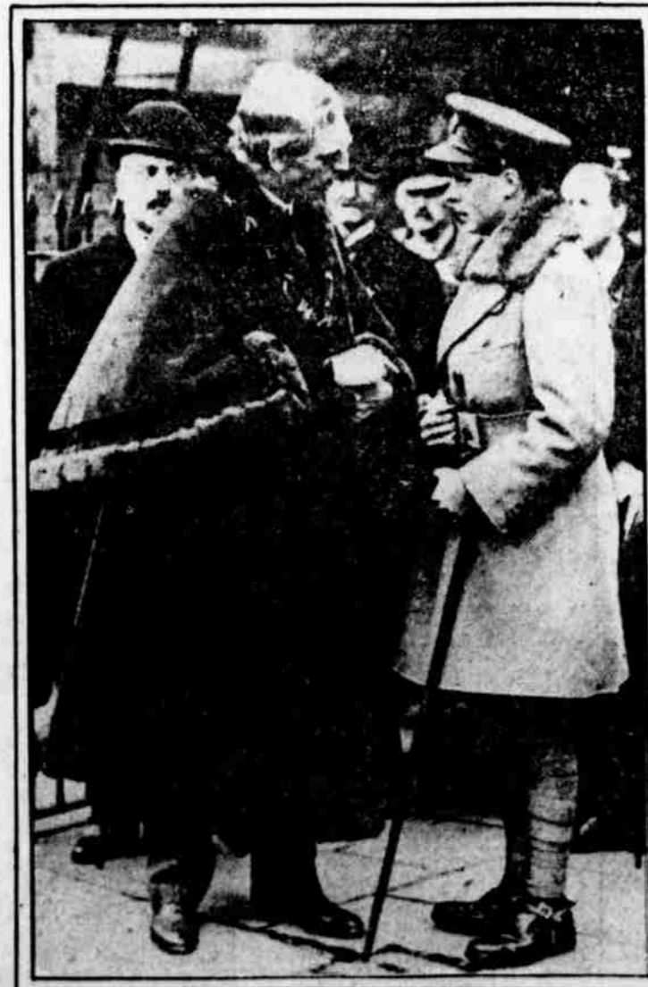
ALL BRITAIN LIKES the Prince of Wales—he is such a likable fellow, with the democratic bearing of any son of Albion. Witness the Lord Mayor of Exeter paying his respects to the Prince, who is visiting that municipality.