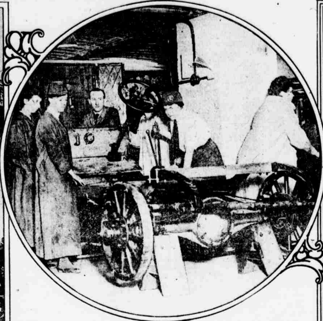
THE HAND THAT ROCKS THE CRADLE now seeks mastery of the more intricate mechanism of the automobile. And if you are a nonbeliever in woman's rights and doubt the mechanical ability of that so-called weaker sex you had better keep away from the Spring Garden Institute, or else be convinced. Believe it or not, there are women there who can take a "tin lizzie" apart and actually put it together again.