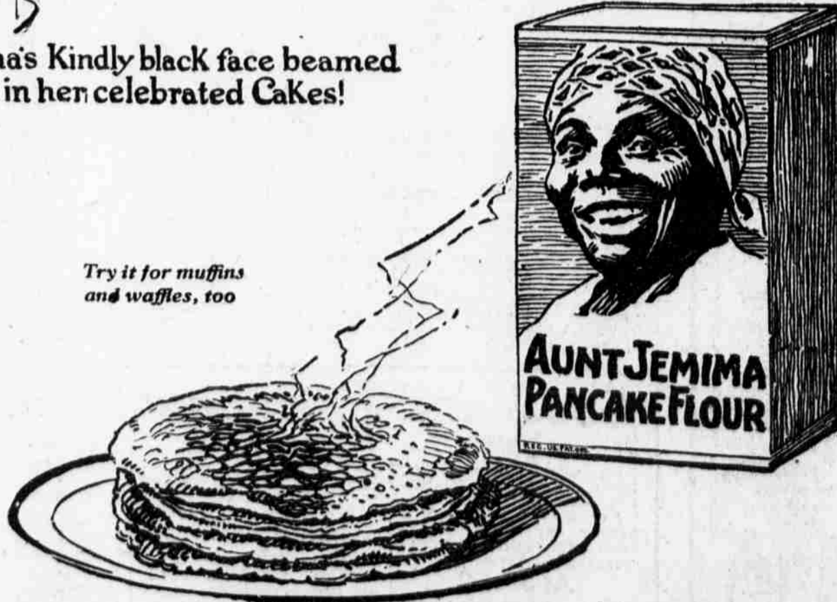
"I'se in town, Honey!"