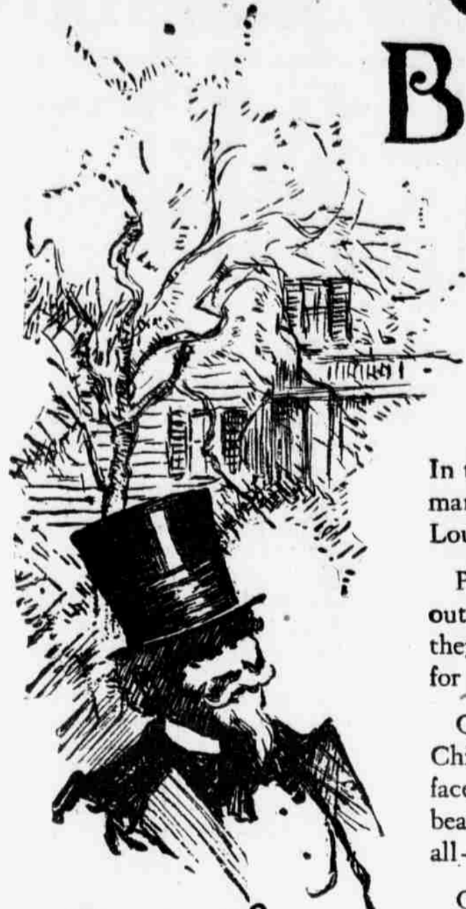
Colonel Higbee who "knew a good horse, svh, and a good dinner!"

In the days "befo' de war" a genial open-hearted Southern gentleman, Colonel Higbee by name, was the hospitable master of a large Louisiana plantation.