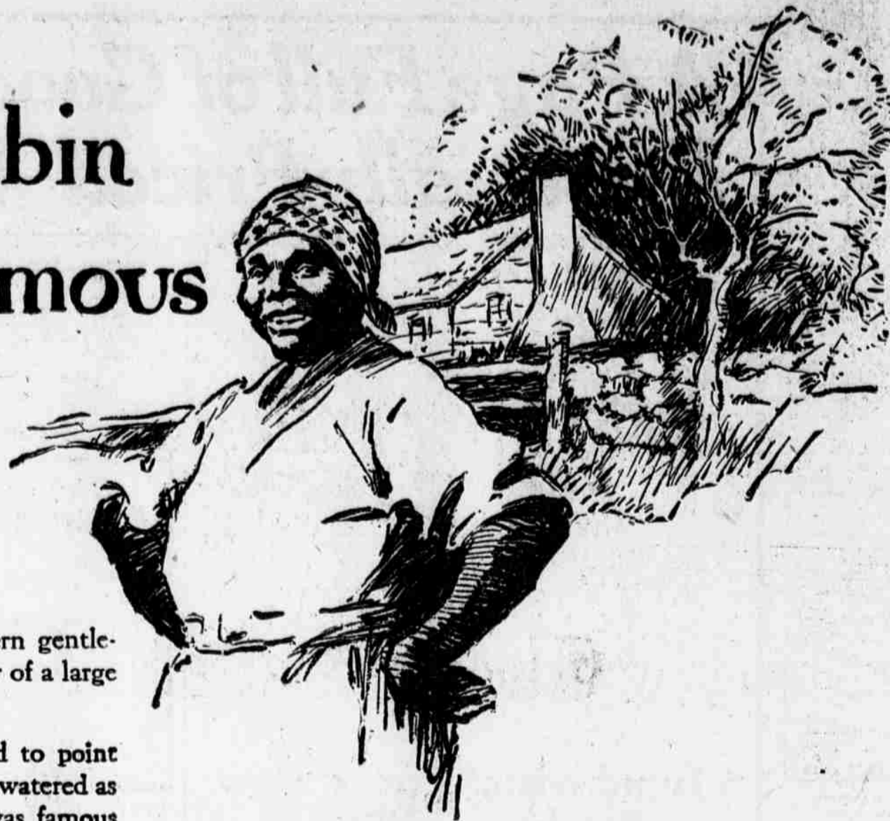
By the rolling Mississippi she lived, years and years ago

Golden-brown were those pancakes Aunt Jemima made—and so tender, so delectable, that they were at once the delight of everyone who tasted them and the despair of all other cooks. For none of the other Southern mammies had a recipe that would make pancakes like that, try as they would.