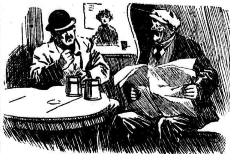
Bill—There 'ere C3 men'll soon be a thing of the past. Jim—Well, wotcher expect? Why, a chap'd 'ave ter drink gallons o' this Government beer to make 'im see two.

THE DARING AERIAL PHOTOGRAPHER GOT A GOOD PICTURE OF THE ENEMY TRENCHES GOOD SOMETHING ELSE