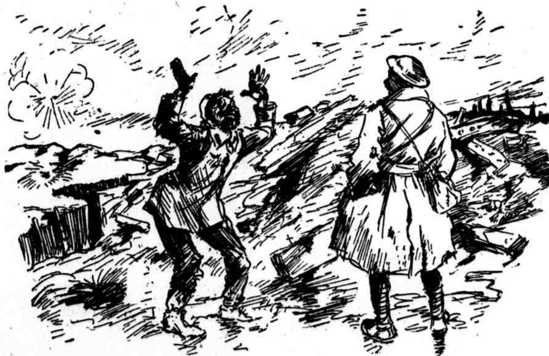
Excited Hun Soldier—Oh, air! Kammerad! I gif meinsel up! I to you meinsel surrender. British Officer—Cut it short, man. This isn't a bally opera!