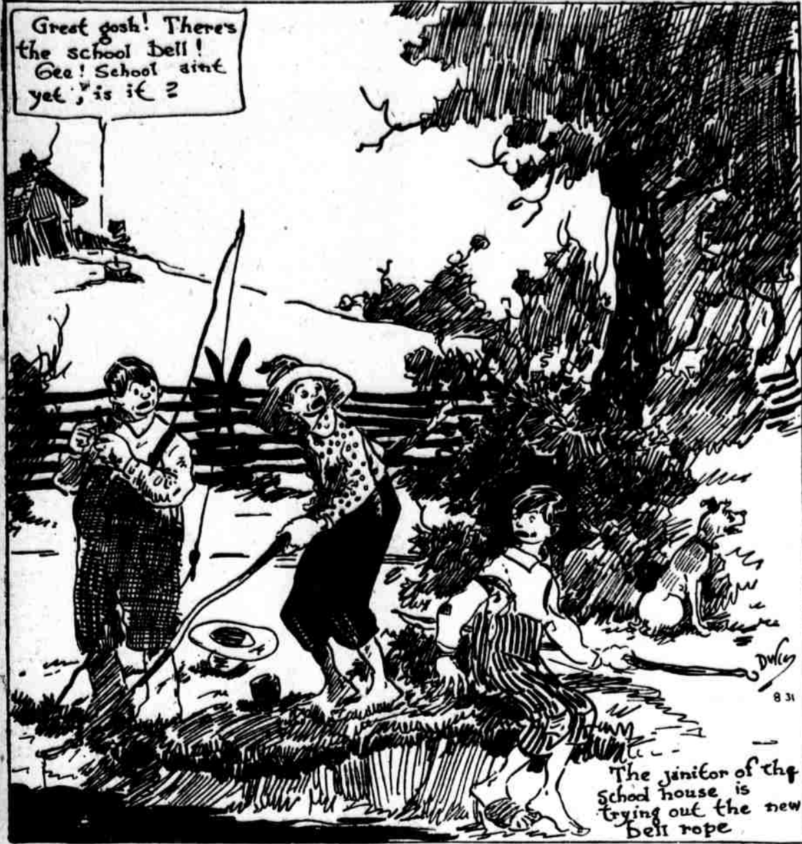
The junior of the school house is trying out the new bell rope