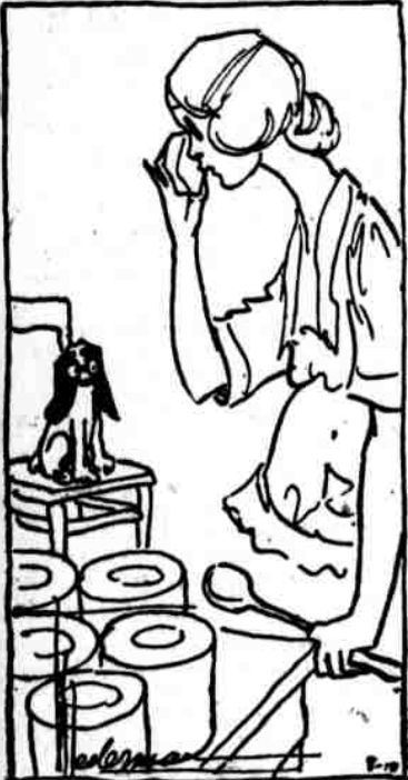
We asked the young lady across the way if she favored reducing the draft age to 18, and she said of course it might be necessary in time to take the younger fellows, but for the present she thought the middle-aged men, those up to 31, would be sufficient.

NOT A WORD FROM MIN YET— ANDY IS SORE— AND TO GET EVEN AFTER A HARD DAYS WORK— HE PUT ON HIS LITTLE PINCH BACK SUIT AND IS GOING TO TAKE A STROLL DOWN THE BEACH TO GIVE THE FAIR BATHERS A TREAT— ANDY NEVER WAS A POKER, YOU KNOW