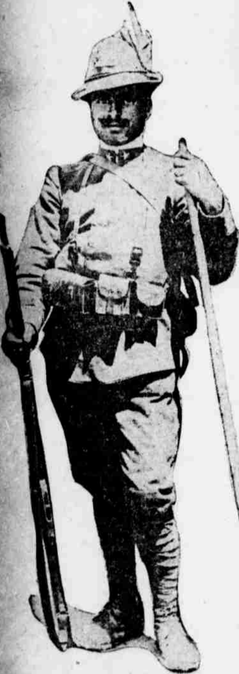
ONE OF THE ALPINI