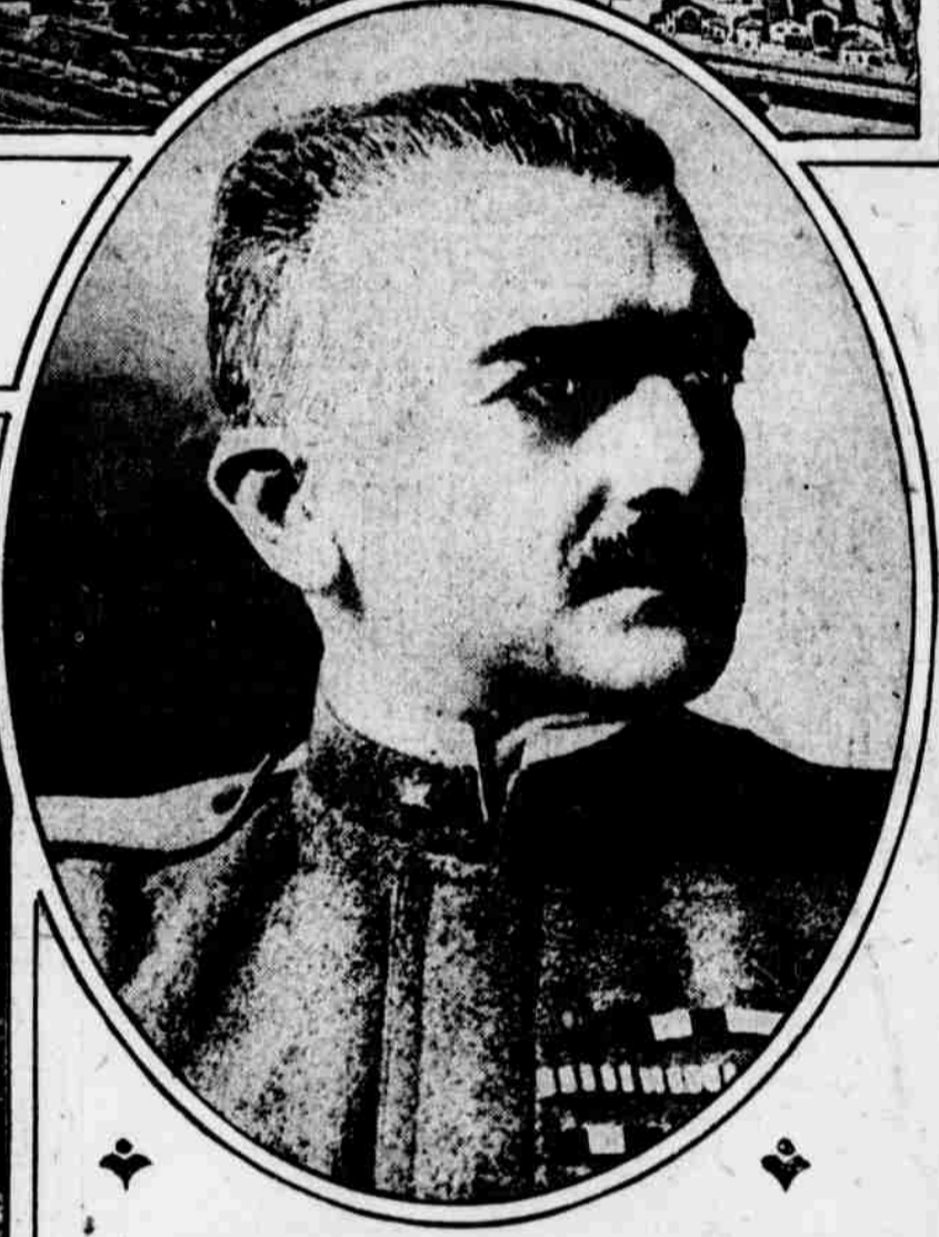
THE CONQUEROR OF THE PIAVE, GENERAL ARMANDO DIAZ