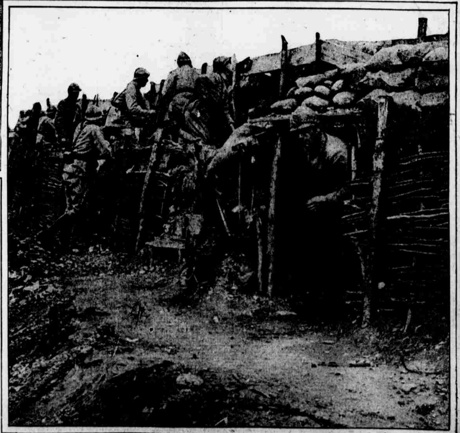
ITALIAN TRENCH SYSTEM on the bank of the Piave River