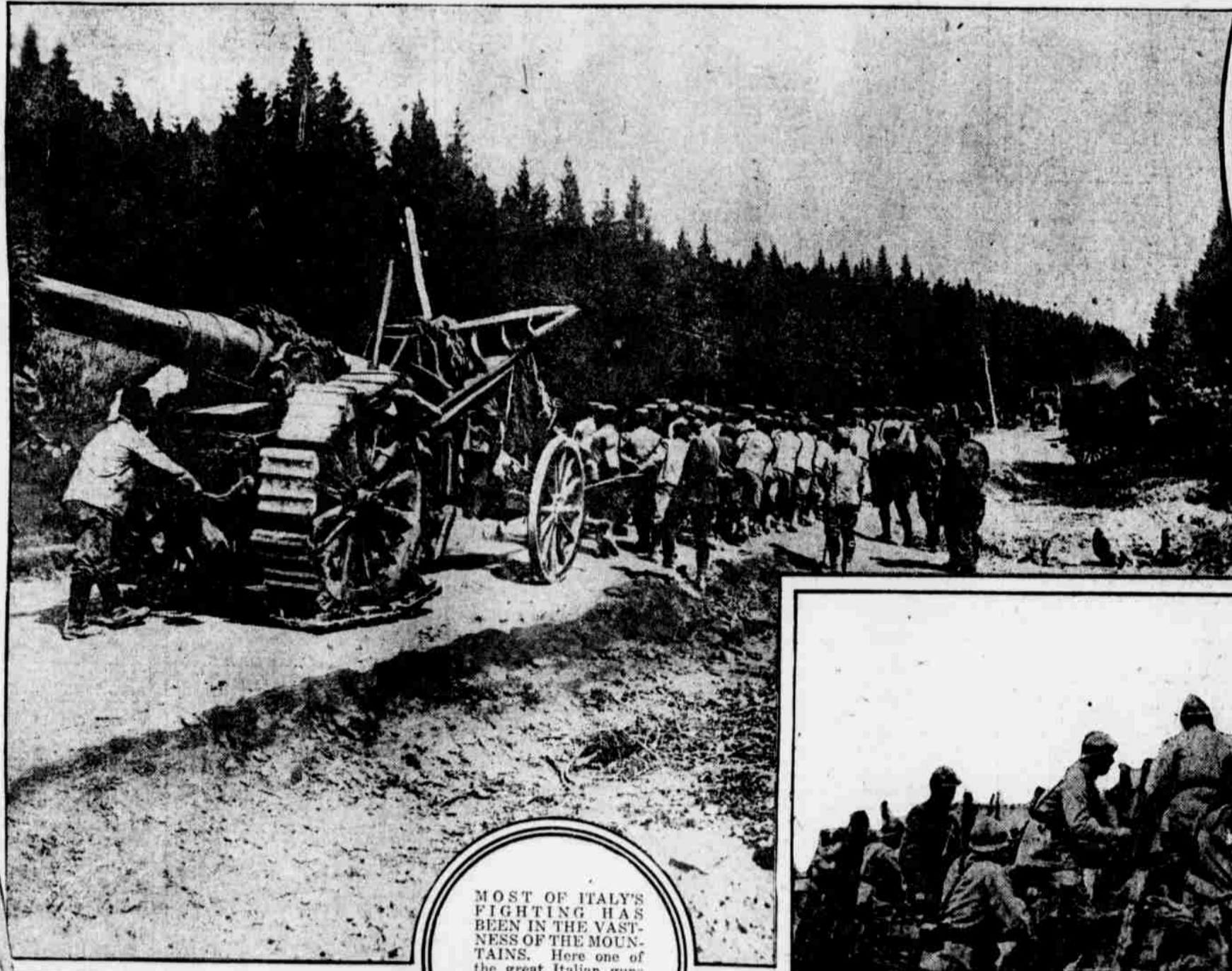
MOST OF ITALY'S FIGHTING HAS BEEN IN THE VASTNESS OF THE MOUNTAINS. Here one of the great Italian guns is being moved slowly forward over a mountain road to its fighting place