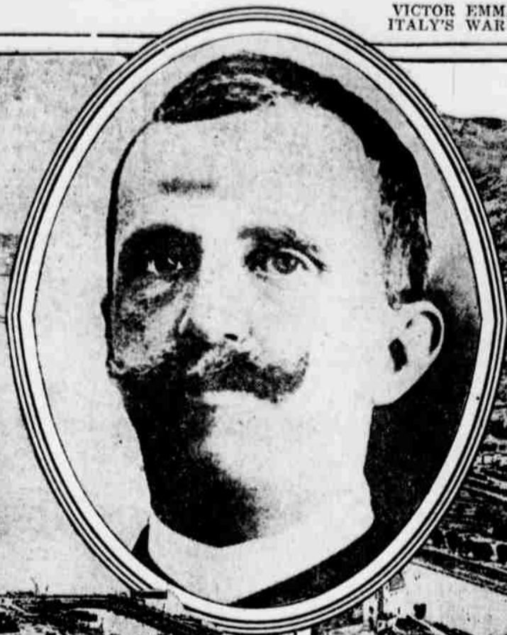
VICTOR EMMANUEL III, ITALY'S WARRIOR KING