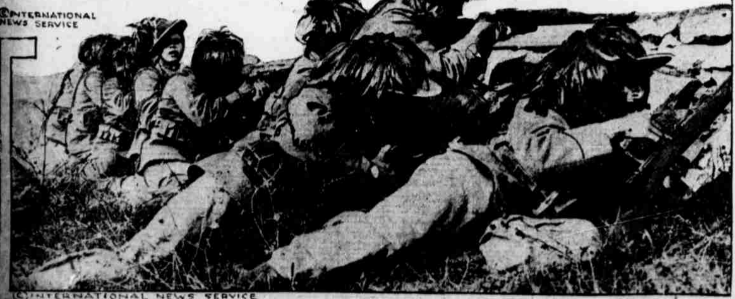
ITALY'S FAMOUS BERSAGLIERI entrenched behind a stone wall