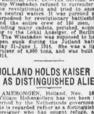
HOLLAND HOLDS KAISER AS DISTINGUISHED ALIEN

Wiesbaden Refuses to Surrender and Is Torpedoed by Mutinous Vessels While Attempting to Escape.