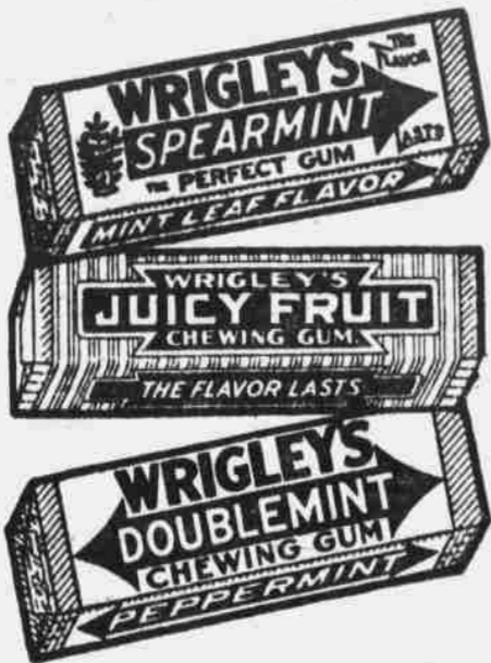
SEALED TIGHT—KEPT RIGHT

in the pink sealed wrapper and take your choice of flavor. Three kinds to suit all tastes.