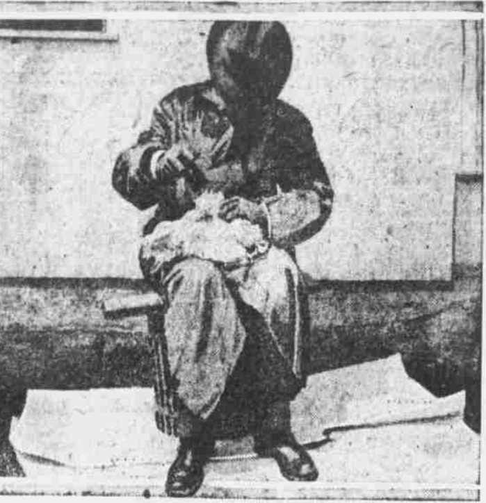
One Method of Saving Valuable Chicken Feed. Give the Fowls a Dust Bath With Sodium Fluoride and Rid Them of Lice and Mites.

Tons of valuable chicken feed which poultrymen give to their fowls is wasted. Although it is eaten by the birds, it does not go to produce eggs or meat.