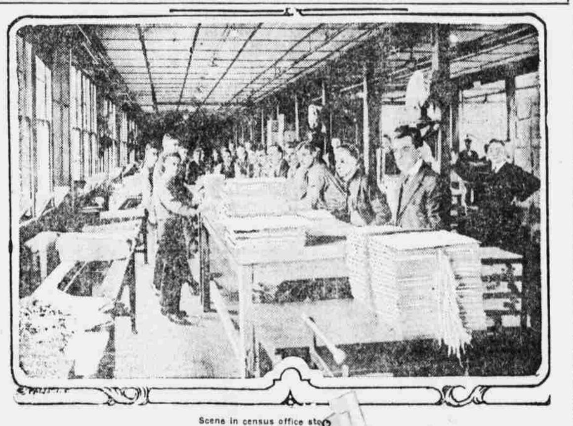
Uncle Sam is now completing arrangements to check up on the total population of the United States in 1920. The census takers are busy getting ready for the task. The photo shows men in the stock room preparing forms, etc.