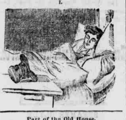
Part of the Old House.

DREAM AND REALITY. How Augustus Hardup was raised to the seventh Heaven of bliss by the Mischiefous Gnomes of Dreamland-The Sad Awakening.