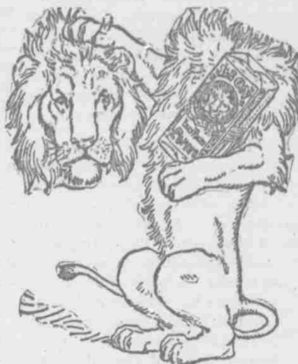
Watch our next advertisement.

MAKE no mistake! See that my head is on every package of LION COFFEE you buy. It guarantees its purity. No coffee is LION COFFEE unless it is in a 1 pound sealed packet with the head of a lion on the front. Then you get pure coffee—the highest grade for the money.