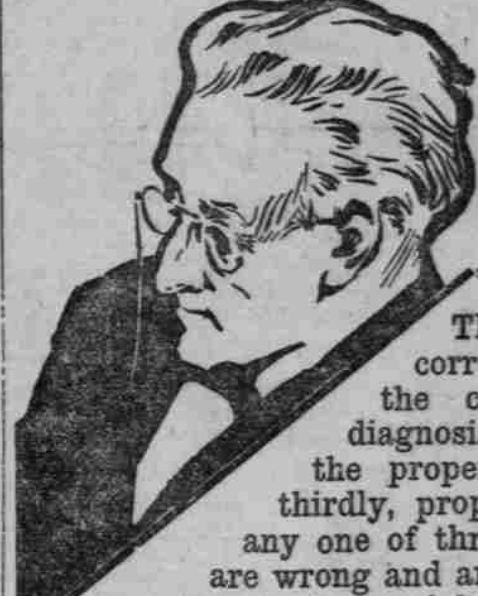
Need Glasses? ASK SEGALL