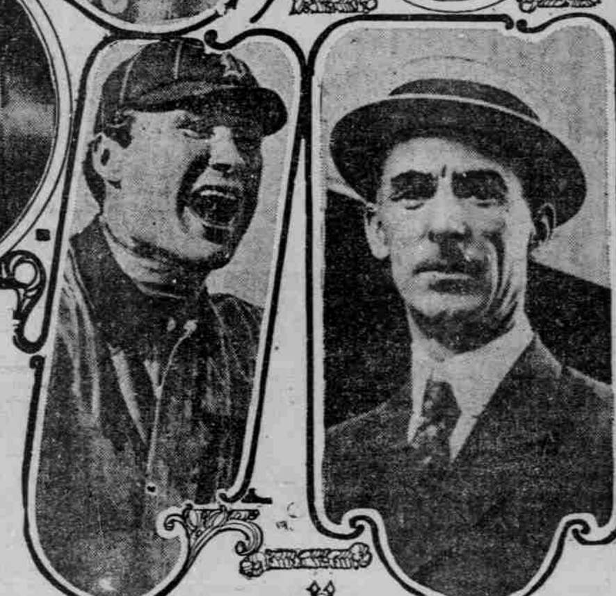
The five men who are leading the main pennant contenders of 1911. Above are Frank Chance, manager of the Chicago Cubs...