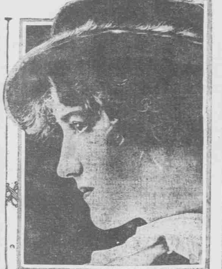
PHOTO WINS HUSBAND