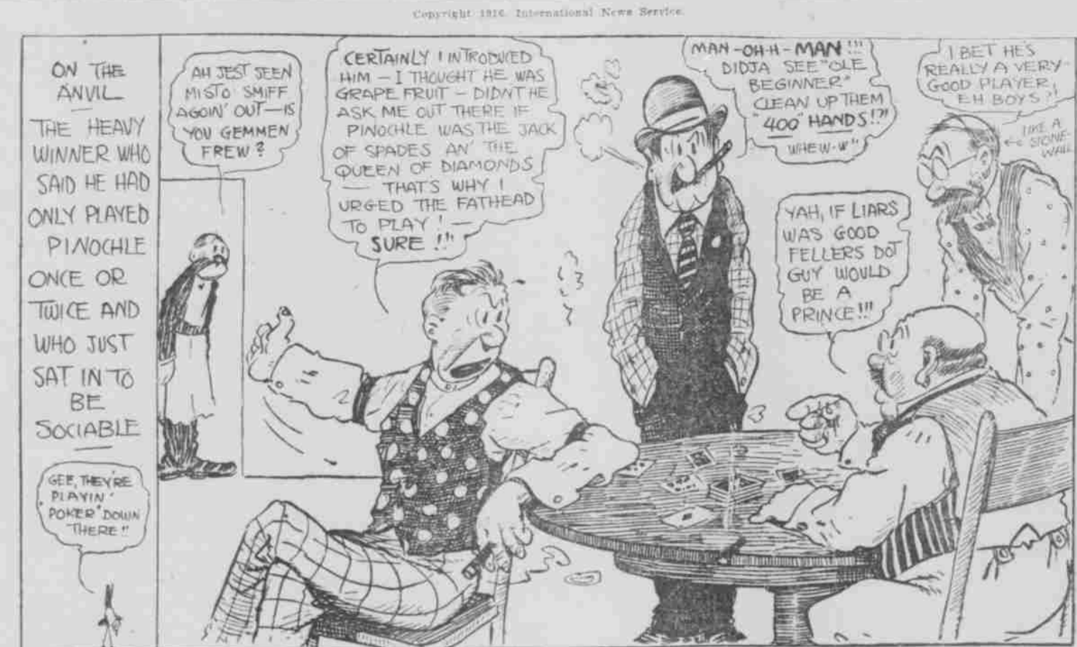
OUR FEATURE FILMS