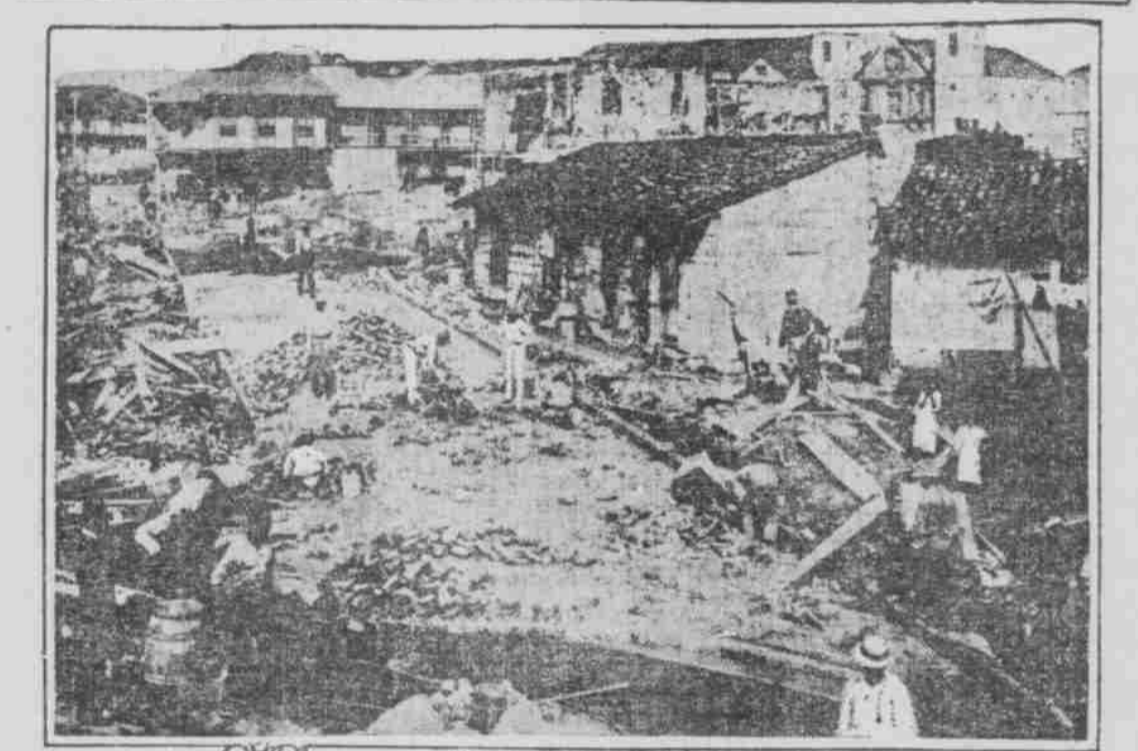
LAYING BRICK STREET IN CITY OF PANAMA.

Panama and Colon now have modern pavements on every important thoroughfare, laid by United States engineers. The question of material gave some concern, as the surface must withstand extremes of temperature and must never be soft enough to permit the adhesion of filth. Sanitary conditions must, above everything else, be maintained. Choice in most cases fell upon vitrified brick, laid on a concrete base with a cement grout filler. An entirely new view of the potentialities of the tropics has been afforded by the success of Surgeon General William C. Gorgas in making Panama a healthy place to live. There is no reason, he says, why the Congo and Amazon valleys must remain comparatively unused by civilized men. It is a simple matter of money and energy to make both of these trackless regions perfectly safe for human habitation and the results would immensely more than repay the outlay. From these two regions, says Dr. Gorgas, more foodstuff could be secured than is now produced in the entire world and with less effort.