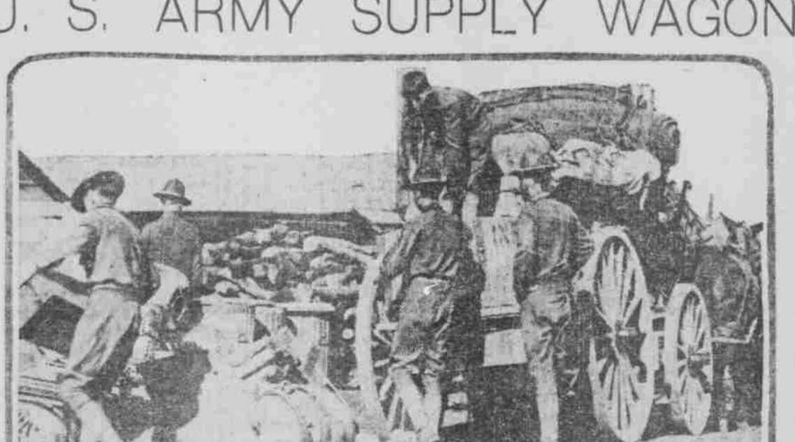
LOADING SUPPLIES FOR THE FRONT.