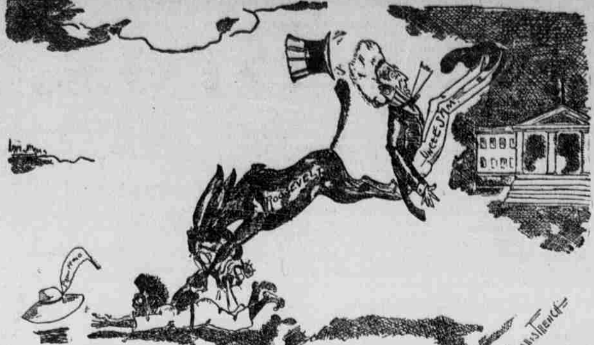
The Mule: Maybe they'll understand after a while that I am it.