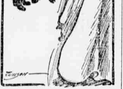
"I Arise From Dreams of Thee!"

The Kerry cow is being written about quite extensively in our foreign exchanges, and it is not improbable that she is among the breeds that will come to the fore in this country.