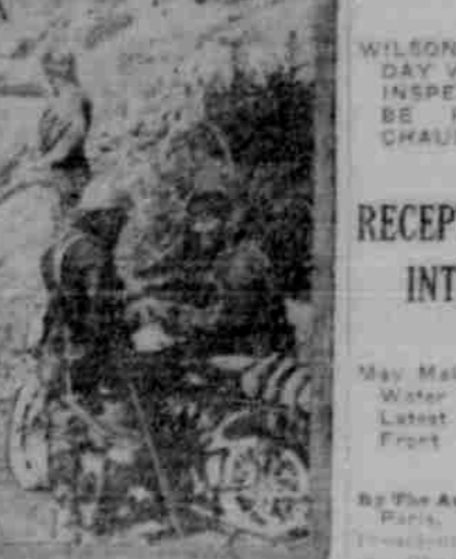
Wilson will eat dinner today with the enlisted men, inspect their billets and be Perishing's guest in Chaumont in evening.