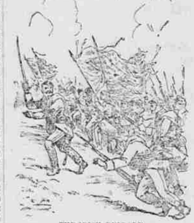
THE IRISH BRIGADE.