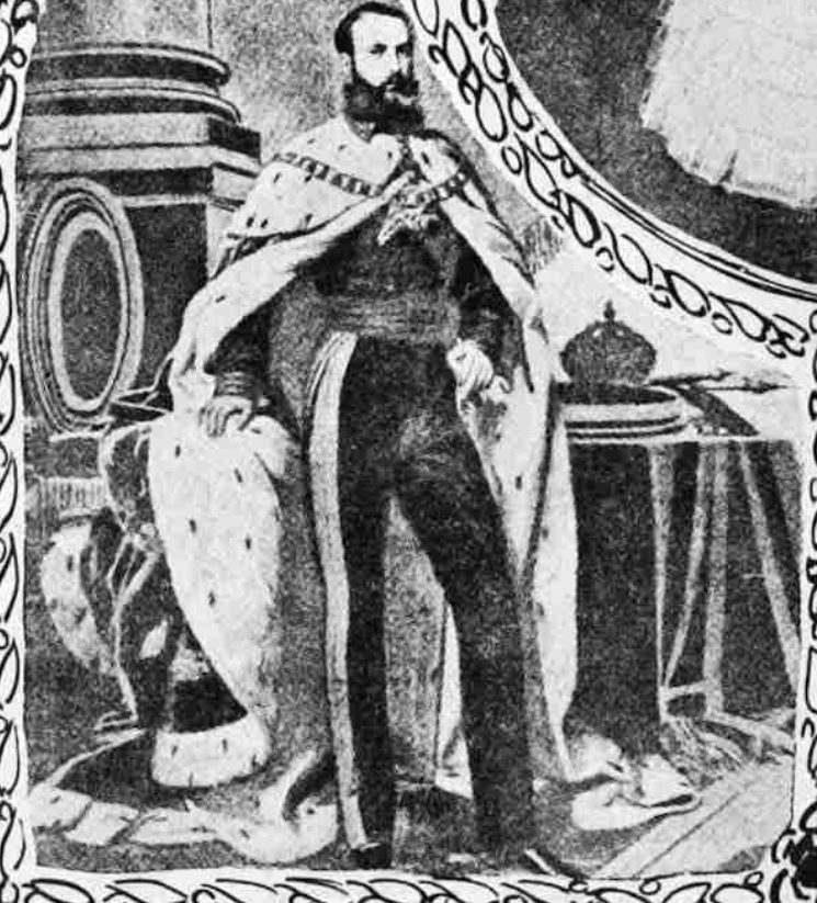
MAXIMILIAN, EMPEROR OF MEXICO