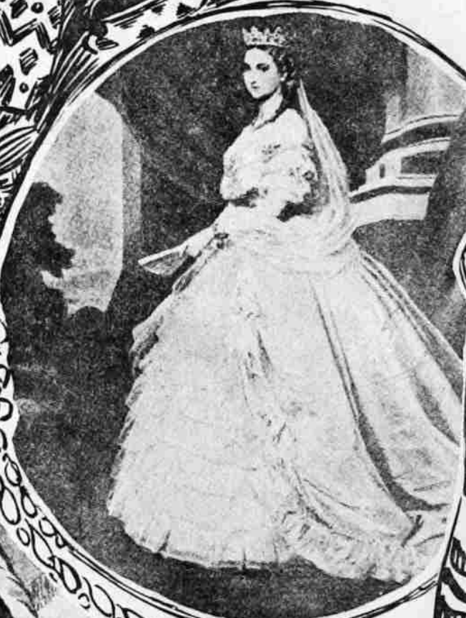
CARLOTTA, EMPRESS OF MEXICO