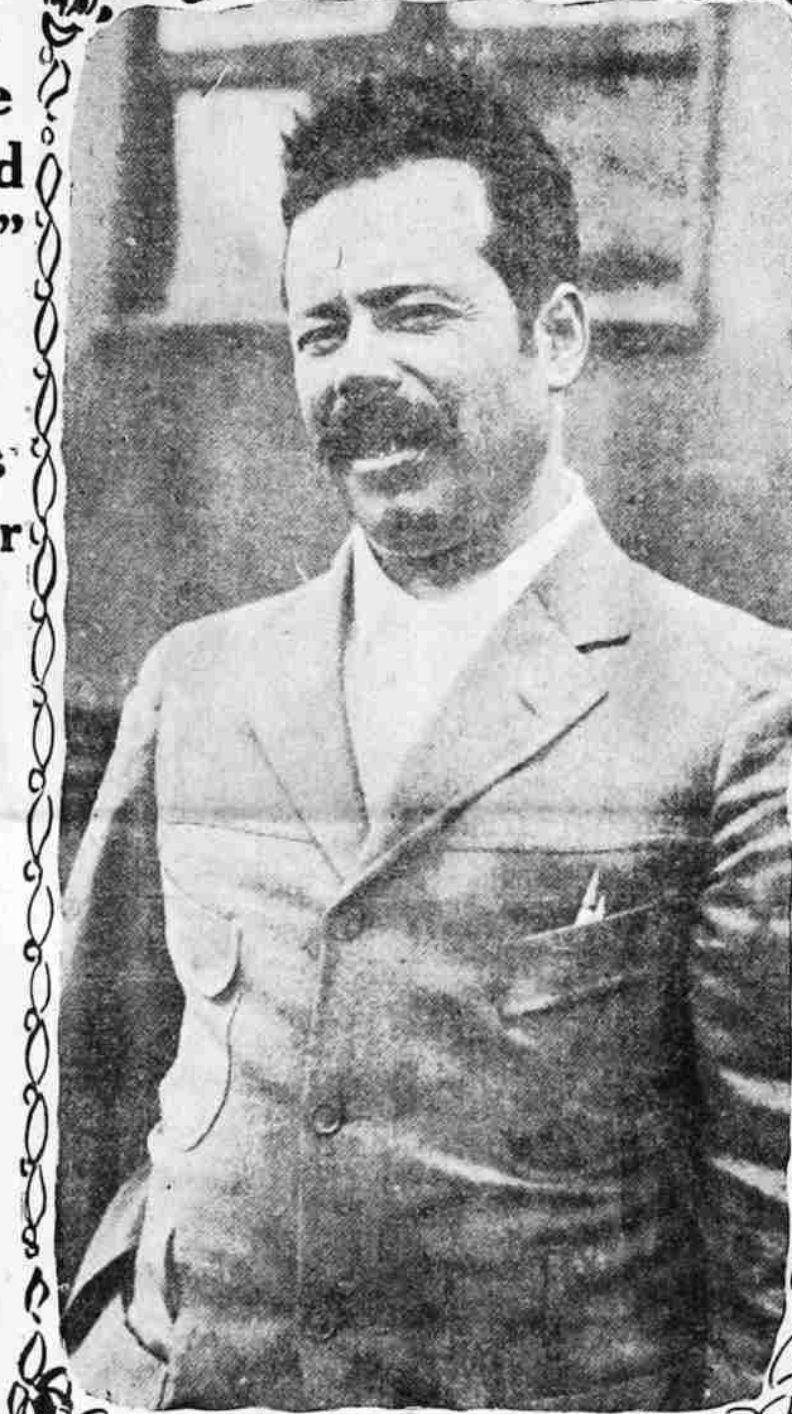
GENERAL RANCHO VILLA

Here are the events that led to Maximilian's regency in Mexico, his