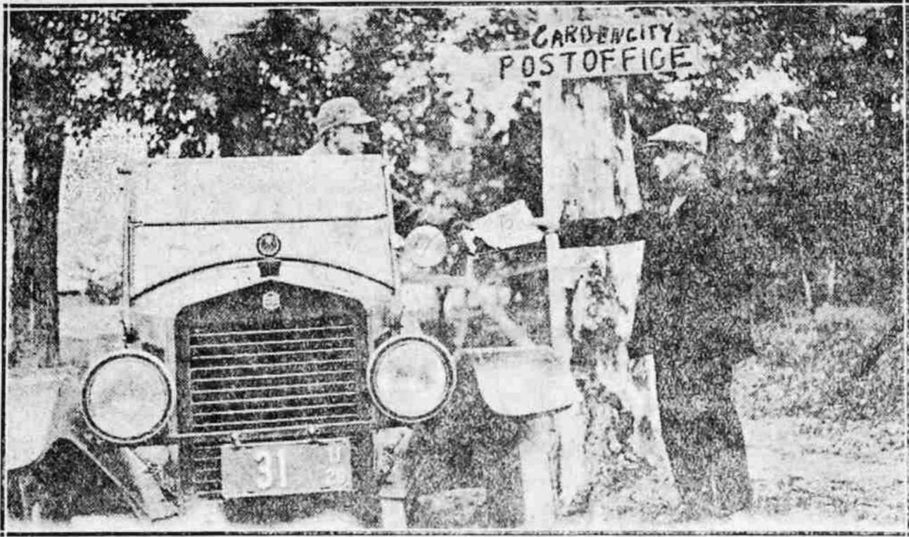
The stop at Garden City. The postoffice receives an early call with a bundle of the morning edition of The Standard-Examiner.

Check on Road Conditions. For the benefit of the many auto-