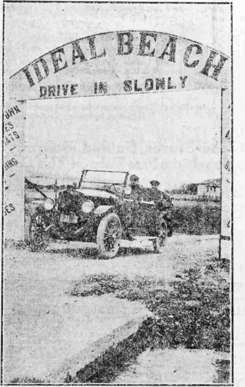
The arrival at Ideal Beach, which the Essex reached in record time without the slightest mishap on the way.

Essex Holds Record. An Essex holds the world's fifty hour endurance record, as well as the world's 24 hours road record, covering 1061 miles in the latter test. The record was made practically all through mountains, making driving hard as well as being a terrible strain on a car at such speed. The Essex driven on the trial trip did not take on gas, oil or water on the whole trip. The carrier capacity of the Essex is 12 1/2 gallons of gas, and the register showed 1 gallon left when the car drew up to the Standard-Examiner office after the trip. The distance traveled was 91.6 miles