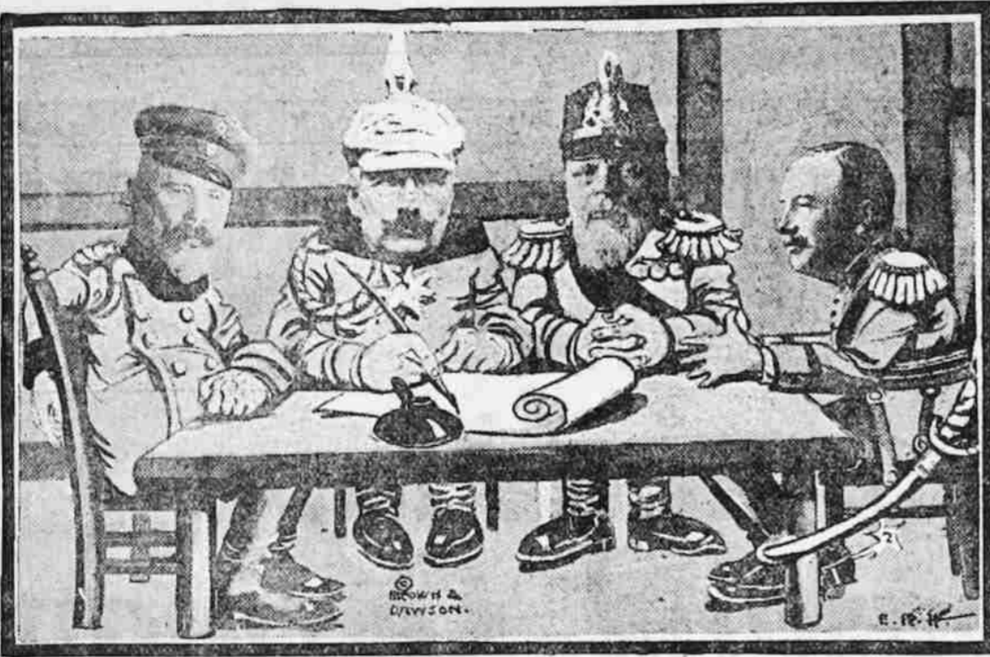
Here you see (thanks to the ever-ready artist) the four kings of Germany (who said "Four Big Powers") in session at Potsdam, called by Kaiser Bill for the first royal conference in years. There are King Wilhelm II of Wuerttemberg, Wilhelm the Damned of Prussia (boss of the concern), Ludwig of Bavaria and Friedrich August of Saxony. Some say the other three kings of Germany are likely to give Prussian Bill the boot.