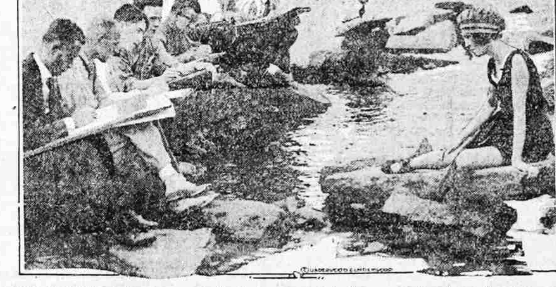
WOUNDED YANKS TAUGHT TO PAINT

PELHAM BAY, N. Y.—It wasn't nice to be wounded in the war, but still— Here's a group of wounded soldiers sketching a "mermaid" on the rocks near here. Uncle Sam supplies instructors, models—everything, and then pays the soldiers while they are fitting themselves for civil life.