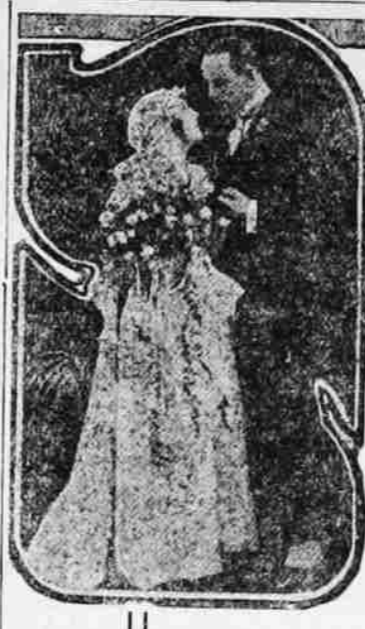
Coming Soon Georges Carpenter in "The Wonder Man"

Music Lovers' Attention Be at the Community Service Offices, 3rd floor Utah National Bank Bldg., at 7:30 Monday evening.