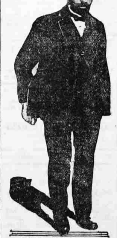
HUGO STINNES BERLIN—The biggest power in Germany today is Herr Hugo Stinnes, German industrial magnate. Stinnes argued with the allies at the Spa conference in an effort to make them reduce their coal demands, but finally yielded. Stinnes is a coal mine and newspaper owner.

The internal revenue bureau, in the fiscal year ended June 30, made the greatest annual tax collection since its establishment in 1862.