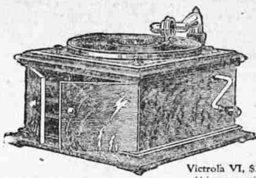
Victrola VI, $35 Mahogany or oak

See and hear these portable styles of the Victrola today at any Victor dealer's. Then you'll appreciate the pleasure they will give you