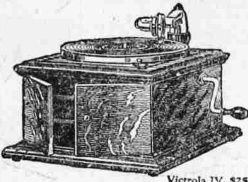
Victrola IV, $25 Oak