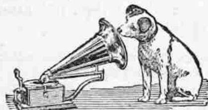
"HIS MASTER'S VOICE"

This trademark and the trademarked word "Victrola" identify all our products. Look under the lid! Look on the label!