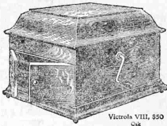
Victrola VIII, $50 Oak

Any of these Victrolas will play any of the more than 5000 records in the Victor Record catalog. New Victor Records demonstrated at all dealers on the 1st of each month.