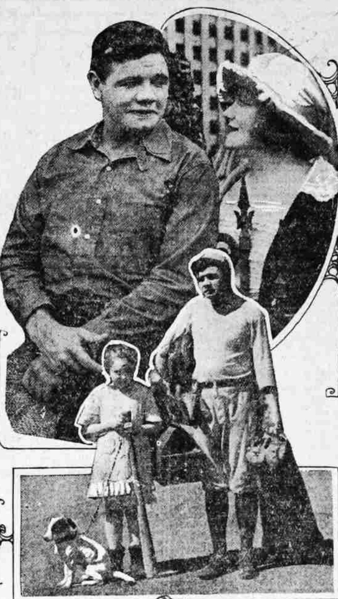
NEW YORK.—Babe Ruth is shown here as the latest movie star in two scenes from the romantic new movie which is being directed by R. A. Walsh. Above, Babe "making a hit" with the banker's daughter; below, Babe being escorted out of town and given the "razz" for defeating the home town, with "Little Sister" and the pup as his only friends and comforters.