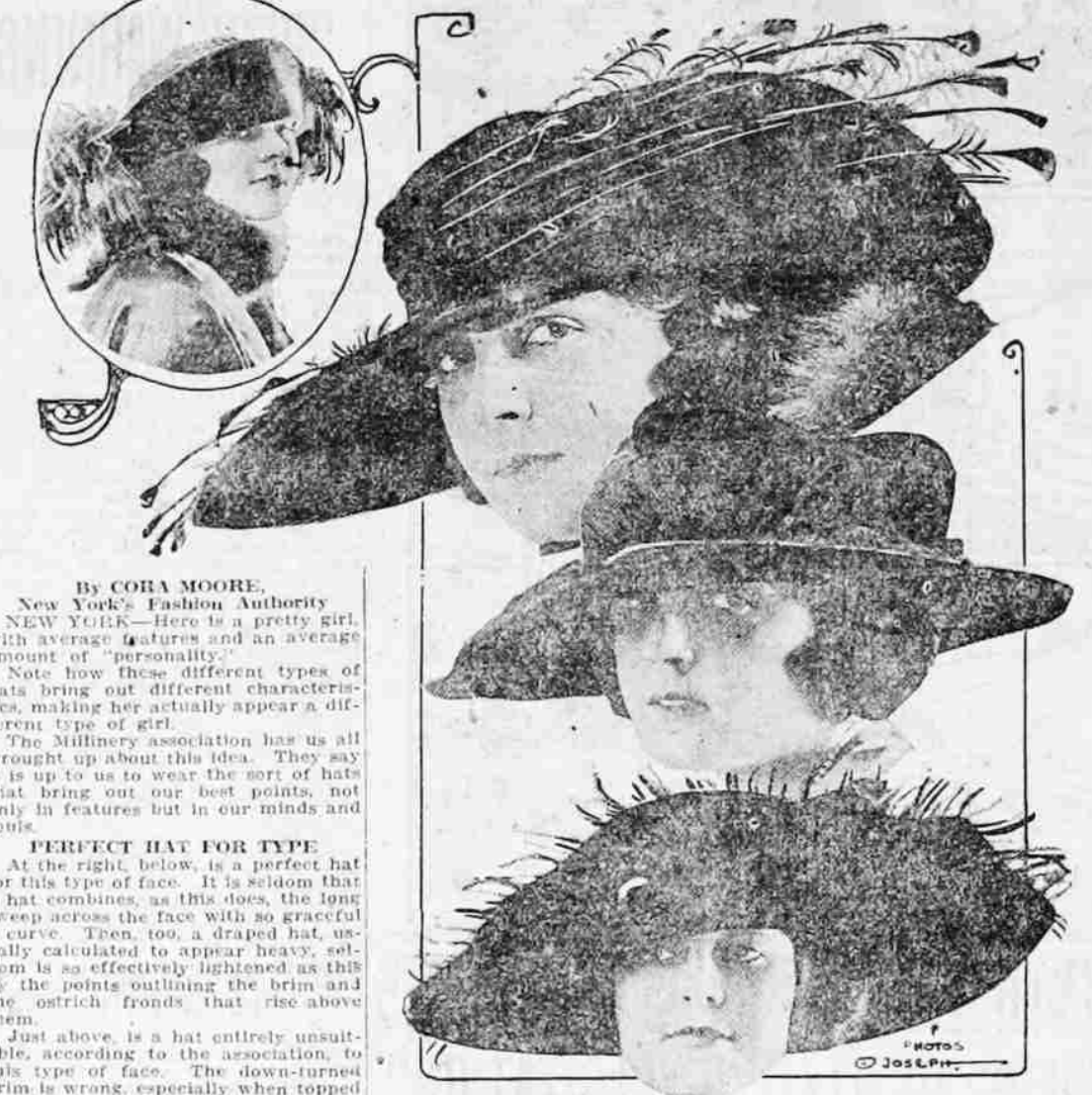
Hats suited to the type: top left and right, below; second on the right, entirely unsuitable, and right above, slightly better adapted.