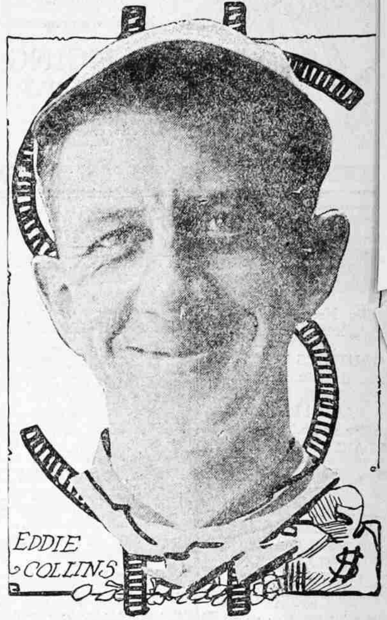
When there's something at stake which involves legal tender, why, Eddie Collins is there like a club sandwich at a lap banquet. If there happens to be a world series or something involved, why, Eddie gets right down to business and does business.