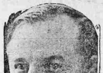
JAMES E. FERGUSON