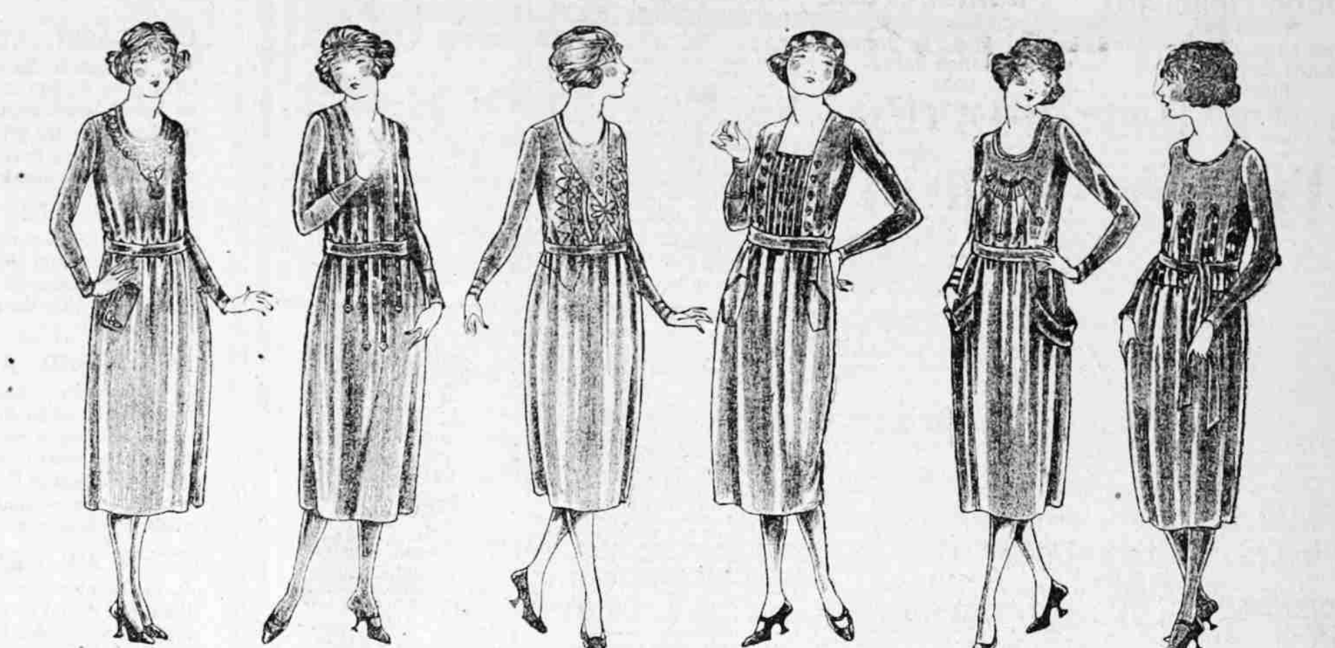
No. 1210R—All Wool French Serge trimmed with silk and tinsel embroidery. Sizes, 16 to 44. Price . . . . . $12.95