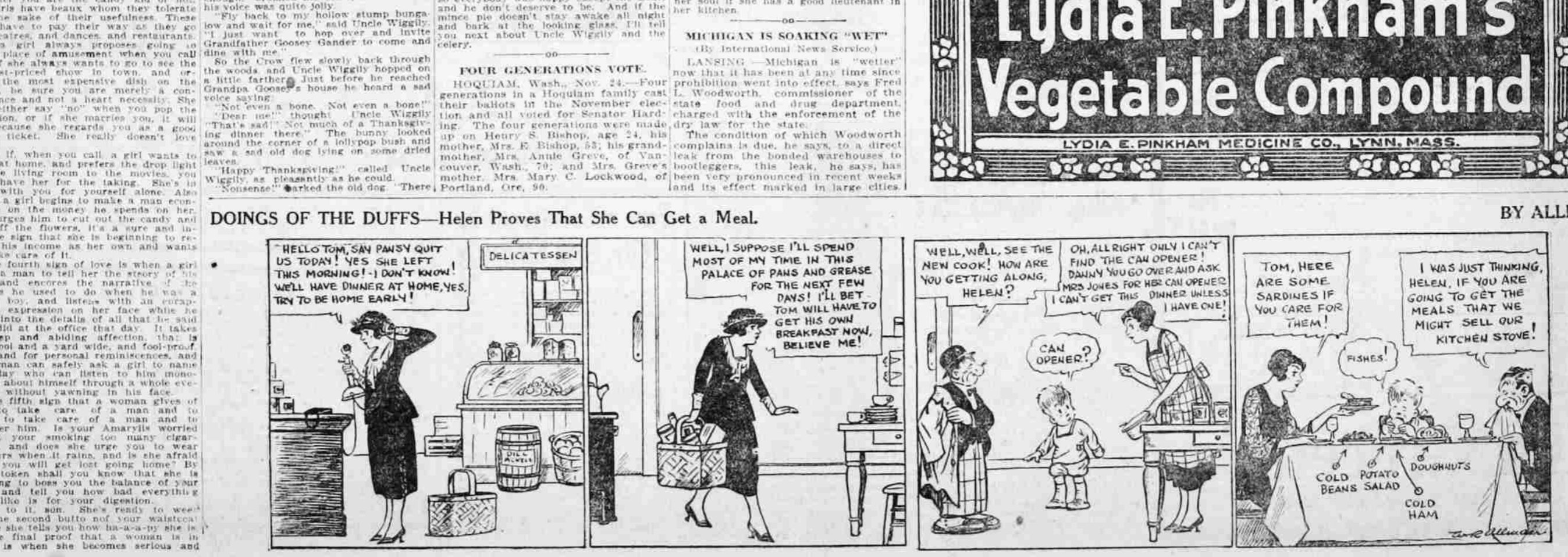
WELL, I SUPPOSE I'LL SPEND MOST OF MY TIME IN THE PALACE OF DAME AND GRASS FOR THE NEXT FEW DAYS! I'LL BET TOM WILL HAVE TO GET HIS OWN BREAKFAST NOW, BELIEVE ME!