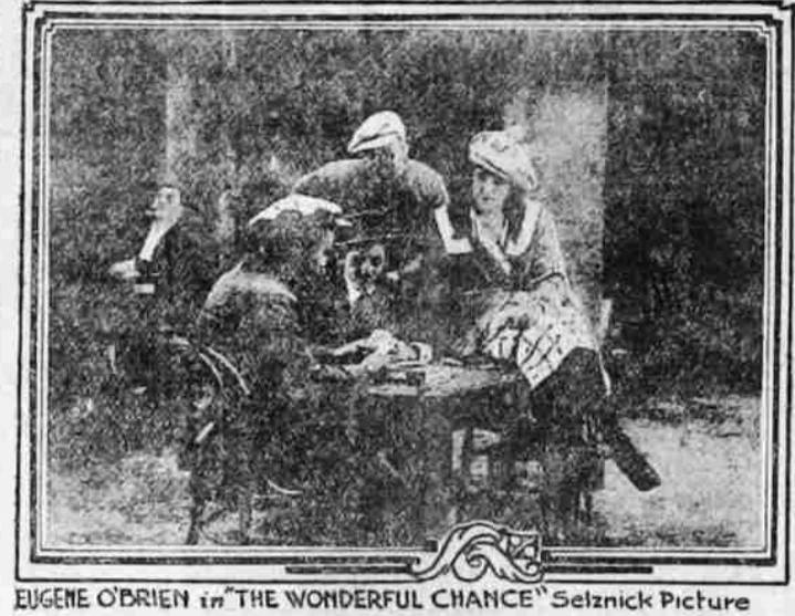
EUGENE O'BRIEN in 'THE WONDERFUL CHANCE' Selznick Picture