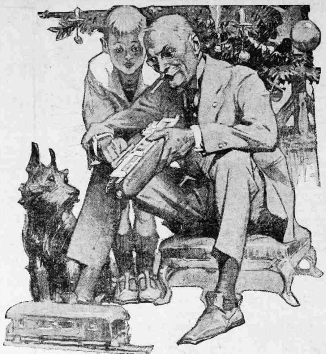
Copyright 1920 Hart Schaffner & Marx

OGDEN ELECTRIC SUPPLY CO. 2430 Washington Ave.