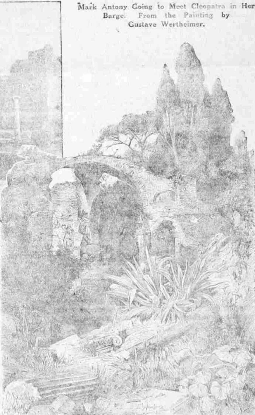
Ruins of the Period of Augustus at Tibur, Near Rome, Where the New Statue of the Emperor Has Been Found.

The resemblance between Augustus and his grand uncle, Julius Caesar, is striking. There is the same aquiline nose, broad