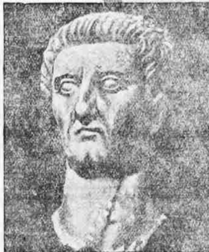
The Bust of Augustus Caesar, Just Found at Ancient Tibur, is Particularly Interesting Because It Shows the Aged, Weary Features of Augustus, As Contrasted with the Vigorous Face of the Vatican Statue.