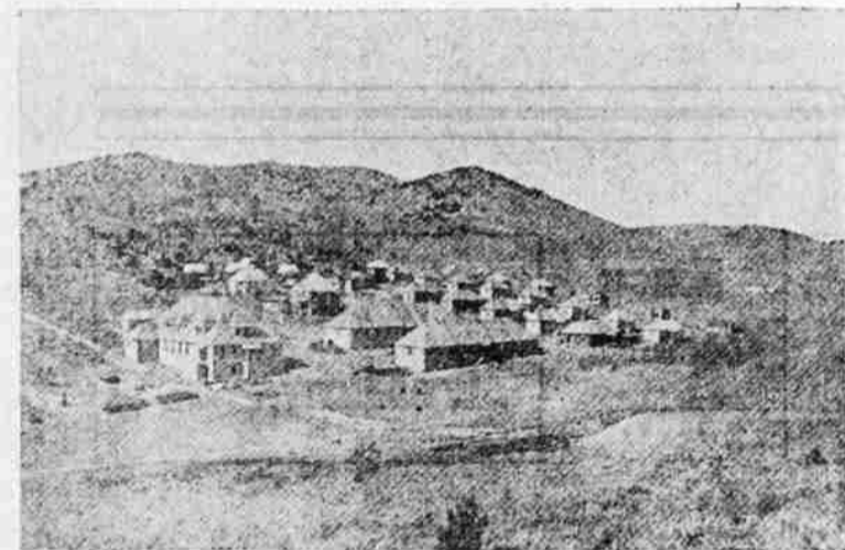
Boarding House and Cottages of Miners at Veteran Mine of Cumberland-Ely Copper Company, October 1, 1907.

Without a rival, except its neighbor, the Nevada Consolidated, the Cumberland-Ely Mining company has been steadily developing its magnificent estate during the past year, with the most gratifying results to its stockholders.