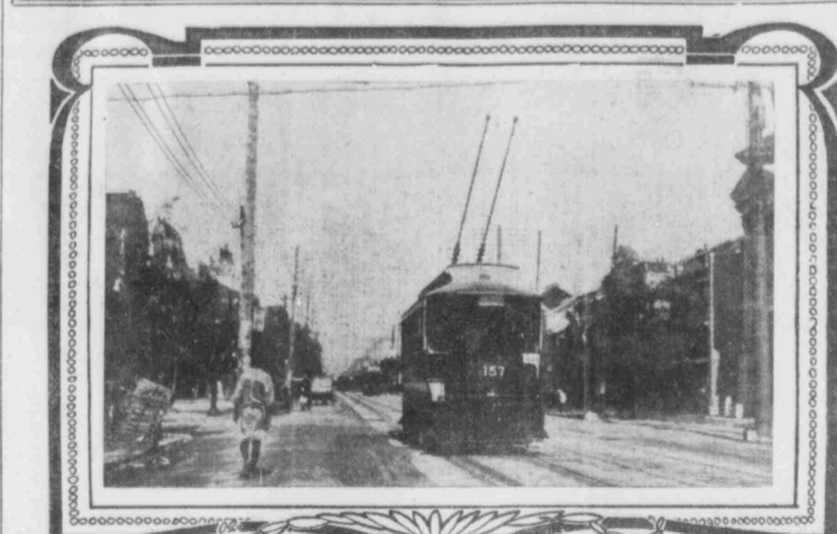
JAPAN HAS ELECTRIC CARS WITH TWO-CENT FARES.

Japan is Worth Twelve Billion Dollars—It Owes 1,000 Millions and Spends a Million a Day—A Little About the Wealth of the Country and the People—Banks and Stock Companies Which Pay Dividends—Eight Million Postal Savings Depositors—The New Electric Roads and the Government Railways Whose Rates Are One Cent a Mile—Ship Subsidies Which Pay—Hard Times and the Taxes—Government Monopolies, Etc.