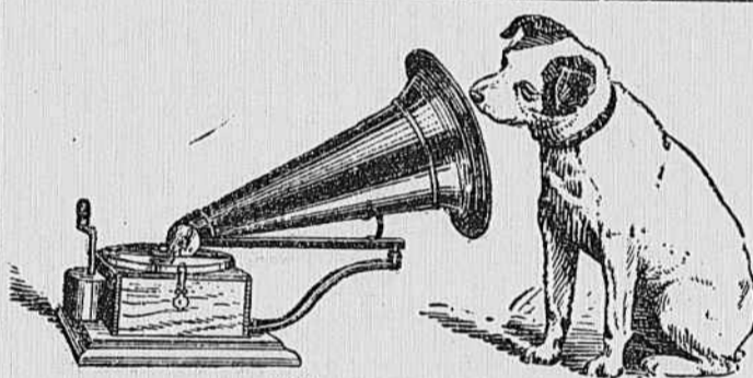
"HIS MASTER'S VOICE"