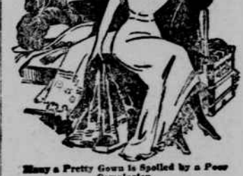
Many a Pretty Girl is Spoiled by a Poor Complexion.

A Wonderful Vanishing Liquid Called Zemo That Bids Farewell to All Pimples and Facial Eruptions. In a Day or Two They Go.