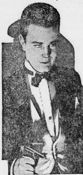
LEW AYRES, Baby Face Gangster in "Doorway To Hell," starting Monday at the National Theatre.