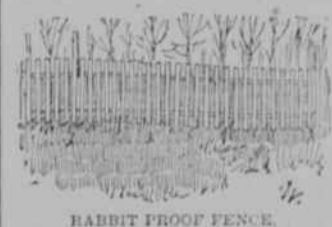
RABBIT PROOF FENCE.

Rabbits are very easily caught, notwithstanding their well known cunning. One of the simplest and best traps used for the purpose is made of rough fence boards six inches wide and about two feet long. These pieces are nailed together so as to make an oblong box, one end of which is closed with a short piece of board, while the other is provided with a board consisting of another piece of board which slides down from above in grooves cut