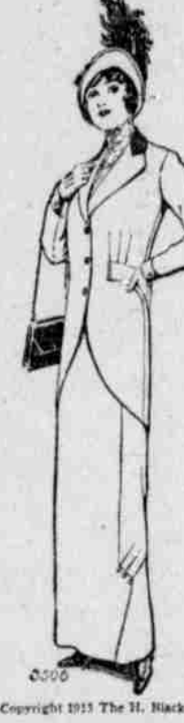
Copyright 1913 The H. Black Co. U.S.

We are offering a lot of odd suits in blue, brown and garnet, at about one-fourth off from the regular price. These are the season's best suit values, that we bought under price and a few we have had in our stock and cannot duplicate. See these values.