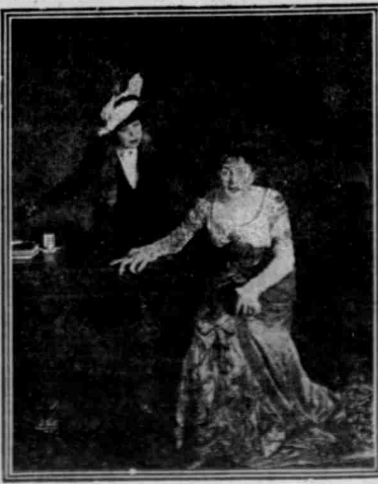
SCENE FROM "THE THIRD DEGREE"

Seats on sale at Drown's Friday night at seven o'clock