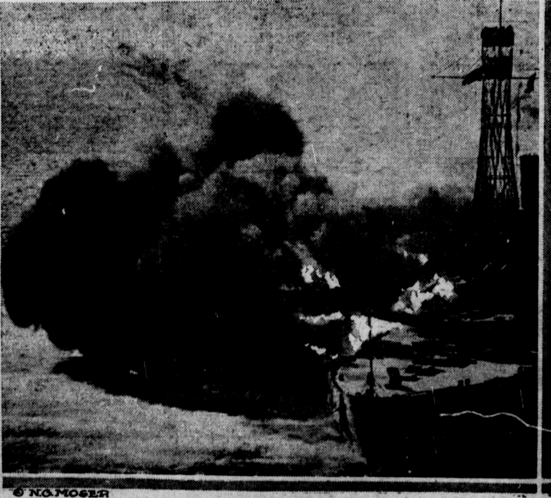
United States battleship New Hampshire in Mexican waters, photographed while firing a broadside.