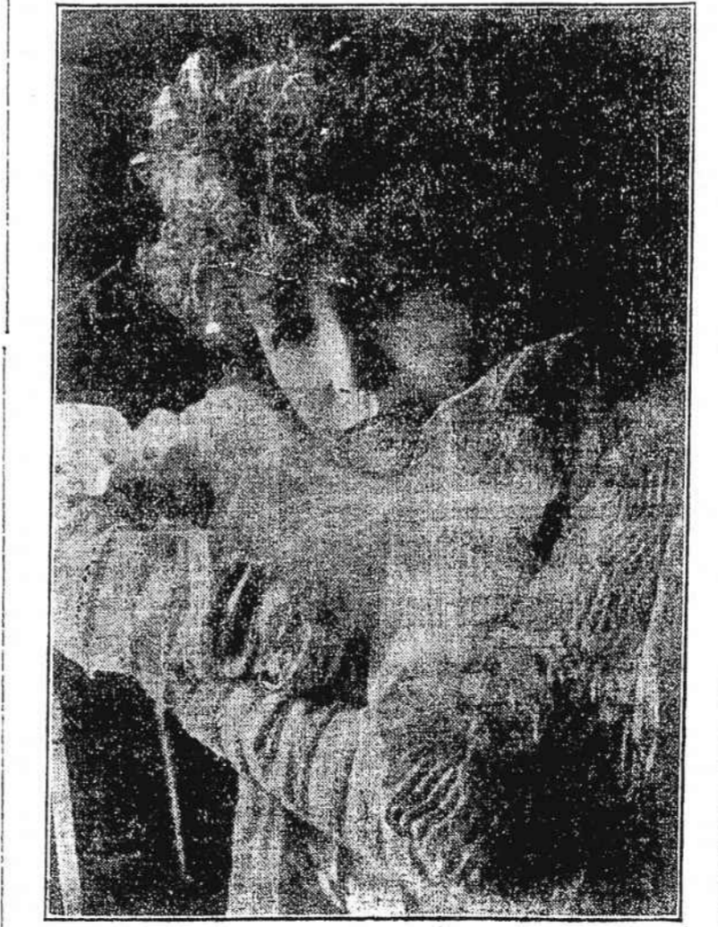
Mme. Sarah Bernhardt, Who Comes to the Court Tuesday Evening, November 28.