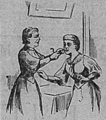
REMOVING THE REPTILE.